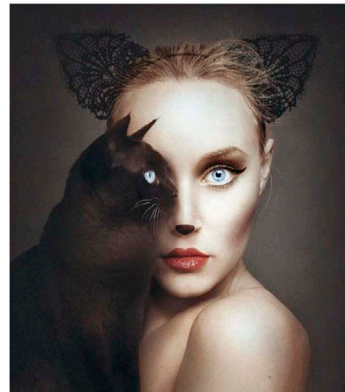
FLORA BORSI / HUNGARY "ANIMEYED - KITTY"